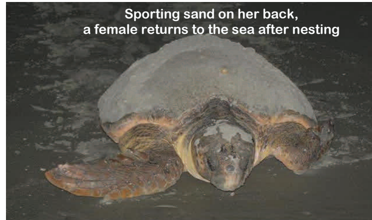
Sporting sand on her back, a female returns to the sea after nesting

The loggerhead has a massive skull and a body weighing 250-400 pounds and reaching up to 4 feet long! Like all sea turtles, loggerheads have front and rear paddle-like flippers that provide propulsion through the ocean. The upper shell of the loggerhead, called the carapace, is usually a reddish brown color, and the lower shell, called the plastron, is dull brown to yellow. The two shells are composed of horny plates called scutes.